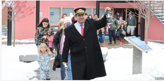
Conductor brings us to train