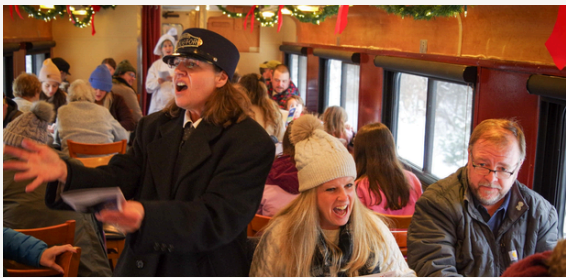
Caroling (in all but Sensory Friendly train cars)