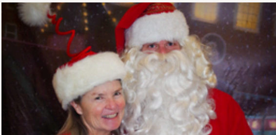
Visit with Santa