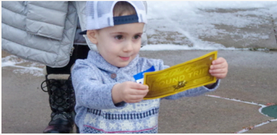
Wait in line for Golden Ticket