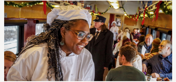
Cookies and hot chocolate inside train