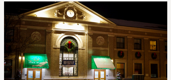
Leave through the magic door!